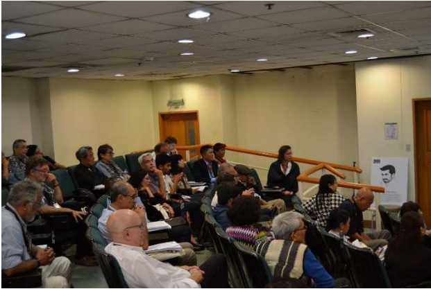
Members of the TLRC Committee

During the Meeting of Translation and Linguistic Rights Committee, the centres involved talked about the concerns about Linguistic Rights and the chair of the TCRC exposed the results and the activity during 2018 and the plans.