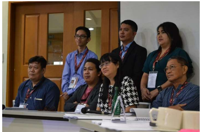
Members of PEN Philippines working on Resolution about Linguistic Rights