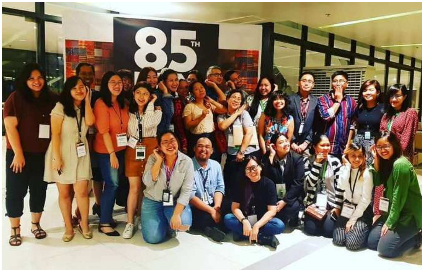
Group of volunteers

SPEAKING IN TONGUES LITERARY FREEDOM AND THE INDIGENOUS LANGUAGES MANILA SEPTEMBER 30 TO OCTOBER 4, 2019